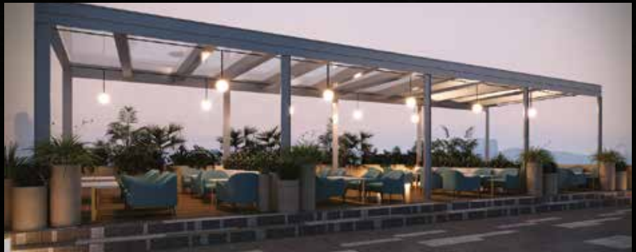
THE PATIO - Cabana Seating