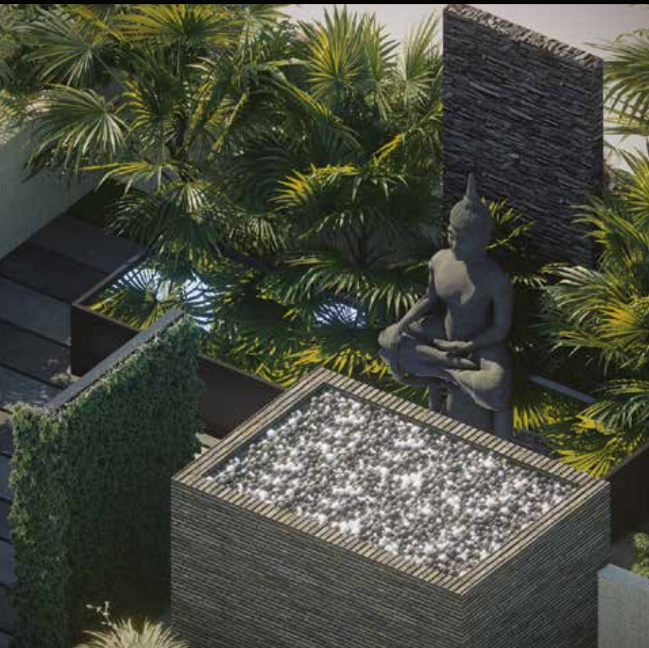
PLUMERIA COURT - Meditation Area